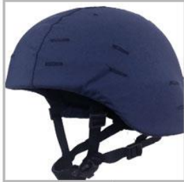
Standard and tactical helmet covers