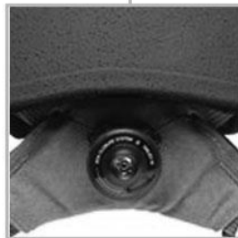
BOA dial harness