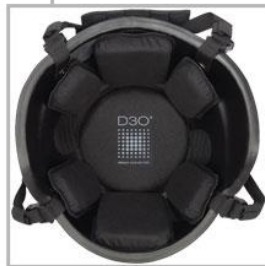
Pad system upgrades