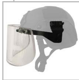
BOA Dial Harness