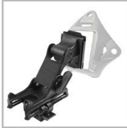
Night vision mount and accessories